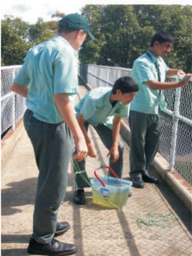
Year 9B1 students checking the health of the Cooks River