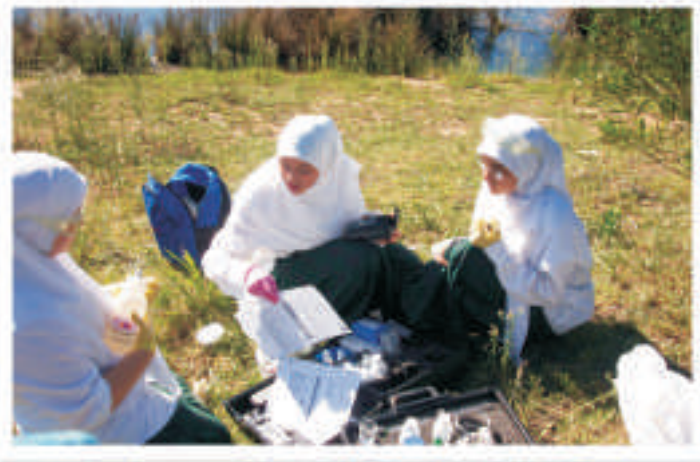
Year 9G1 students monitor the health of the Fresh Creek Wetlands

MFIS group is a committed and a dedicated group. In 2005, at Streamwatch Open Day and Awards Ceremony, the group won the Best New Group award.