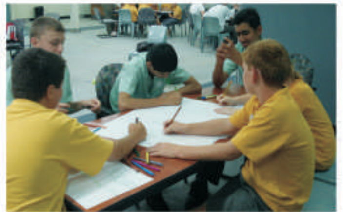
Randwick boys on future visions for the Cooks River