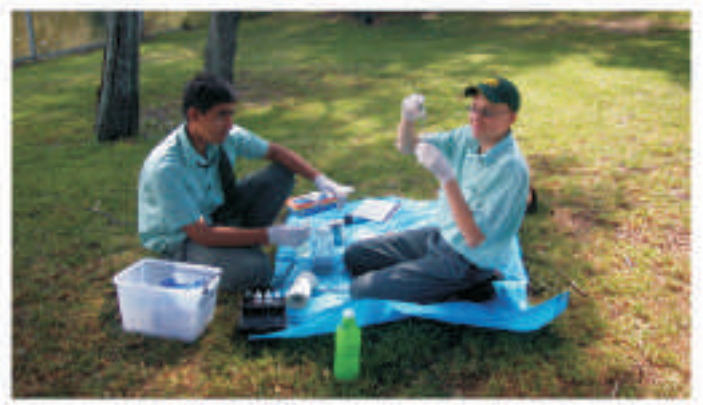
Year 9B1 students checking the health of the Cooks River

All sections of the community, including our young people have a great contribution to make to create a better sustainable environment.