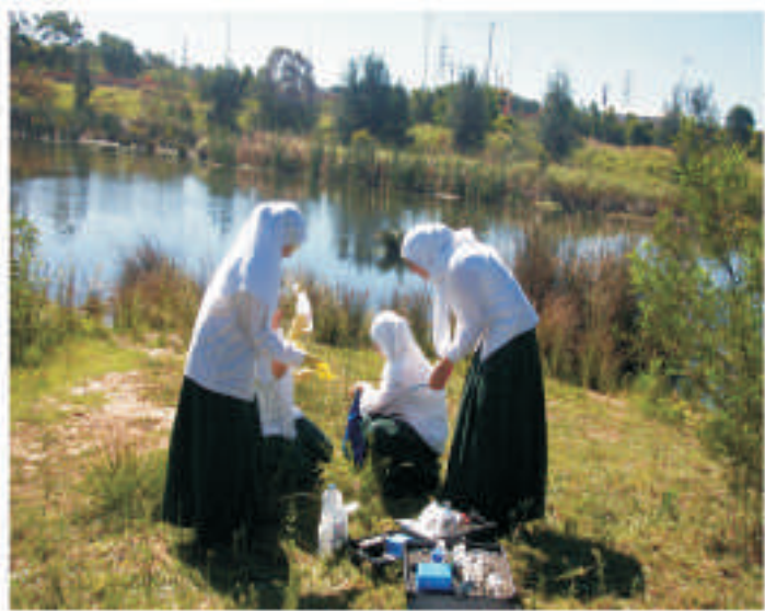
Year 10G1 students monitor the health of the Fresh Creek Wetlands

At present MFIS group is testing at two sites in the Wetland, at the entry point and exit point of the ponds. The students monitor the health of the Freshwater Creek Wetlands every fortnight using water quality parameters such as dissolved oxygen, turbidity, faecal coliform, electrical conductivity, phosphorous, temperature and pH.