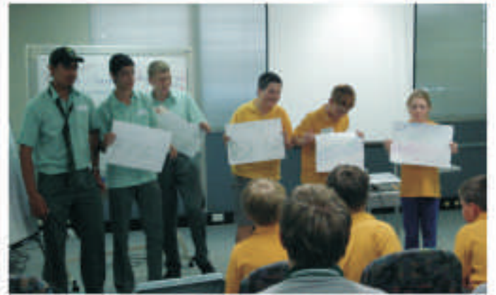
Our students working with Banksmeadow from the lower eastern suburbs