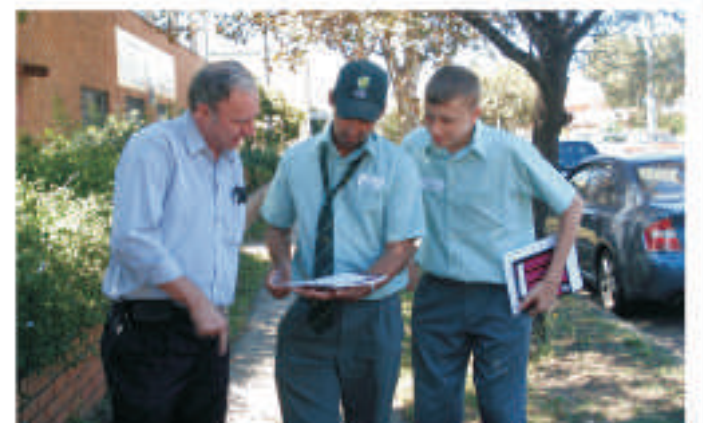
Our students conducting a survey in the community about the state of the Cooks River