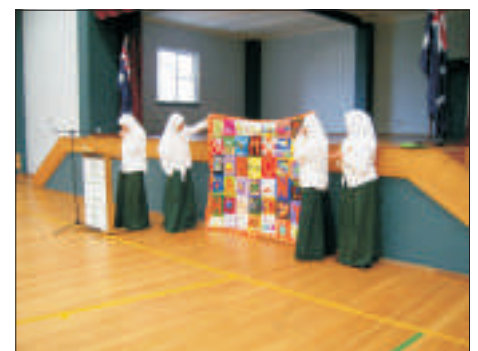
Our students showing the harmony patch quilt cover, which was made by three schools