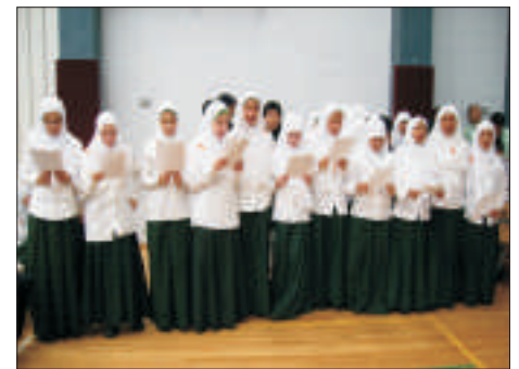
The school choir singing the Australian National Anthem